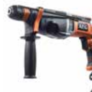
KH 28 Super XE