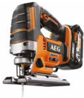
BST 18BLX NEW