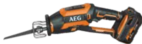
BUS 18CBL NEW