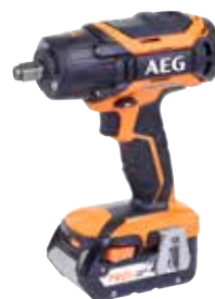
BSS 18C 12Z BL