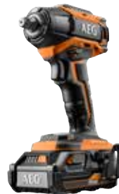
BSS 18C12ZB6 NEW