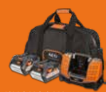
18V 2 X 2.0AH PROLITHIUM-ION™ BATTERY WITH BL1218 CHARGER IN A BAG