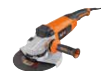
WS 24-180 V