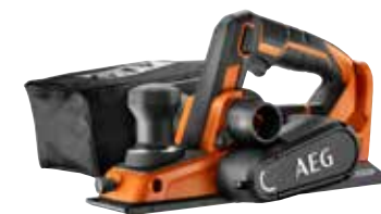
BHO 18BL NEW