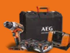
18V COMPACT DRILL DRIVER KIT WITH 2 X 2.0AH BATTERIES