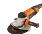
WS 24-230 GEV