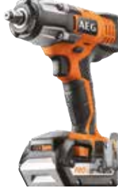
BSS 18C 12Z