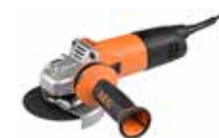
WS 12-125 S