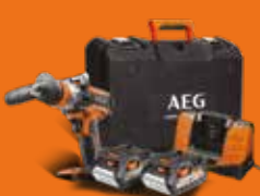
18V COMPACT DRILL DRIVER KIT WITH 2 X 4.0AH BATTERIES