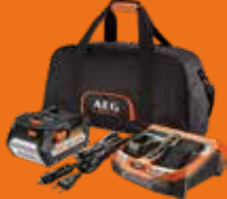
18V 5.0AH PROLITHIUM-ION™ BATTERY WITH BLK1218 FAST CHARGER