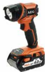
FL 18 New