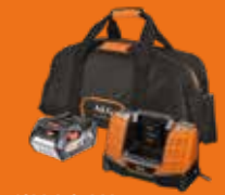
18V 4.0 AH PROLITHIUM-ION™ BATTERY WITH BLK1218 CHARGER IN A BAG